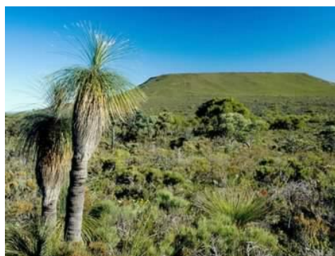
Lesueur National Park scene below; Greenhead Dynamite Bay sunset