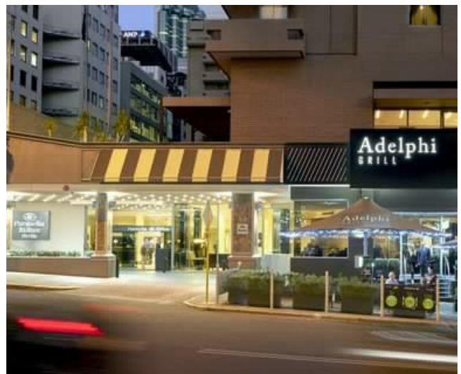
Entrance to the Parmelia Hilton at 14 Mill St Perth