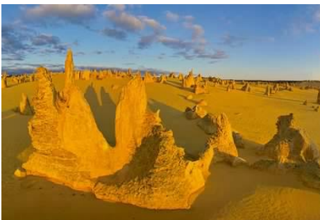
Pinnacles Desert - photo Neil Creek Below; Lobster Shack Cervantes

A willingness to discuss our successes as well as our failures in both growing and in running a business. My past background in